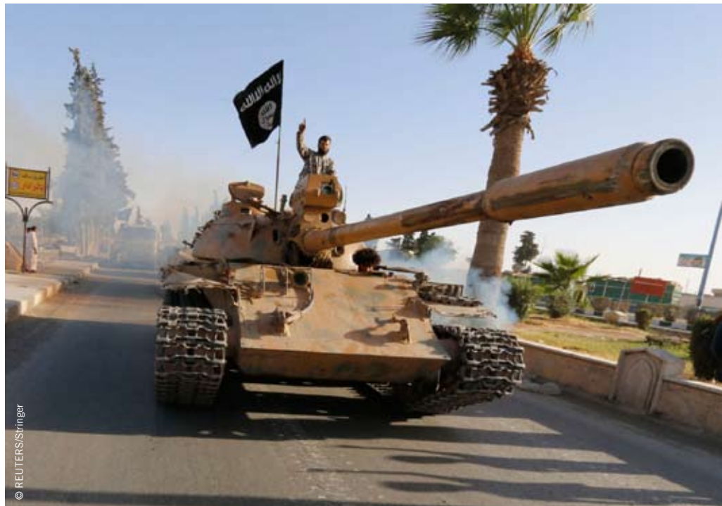
Islamic State fighters take part in a military parade in a captured T-55 tank along the streets of northern al-Raqqah province, Syria, 30 June 2014.

Additionally, during the current conflicts in Syria and Iraq, IS has captured hundreds of light armoured fighting vehicles of more than a dozen different types that were in service with the Syrian and Iraqi armies. However, the vast majority of light armoured fighting vehicles used by IS fighters comprise only a few models: the Russian BMP-1, MT-LB Infantry Fighting Vehicle, and the US M113A2 Armoured Personnel Carrier, M1117 Armoured Security Vehicle, and up-armoured HM-MWV (Humvee) variants.