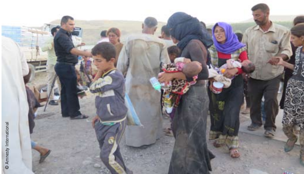
Yezidi internally displaced people arrive in Feshkhabour, Iraq, having fled Mount Sinjar after a week under siege from IS, August 2014

While much of the violence pitted Shi'a militias against Sunni armed groups, in 2008 Amnesty International reported further gross human rights abuses including the targeting of religious and ethnic minorities and others including "Yazidis, Christians, Sabeans and Palestinians... women, human rights defenders, judges, medical doctors and other professionals". 136 More recently, in 2014, Amnesty International documented Shi'a militia groups' systematic abductions and killings of Sunni civilians in Iraq, amounting to war crimes. The Shi'a militia groups were often armed and supported by the Iraqi military, and operating with their tacit support. 137