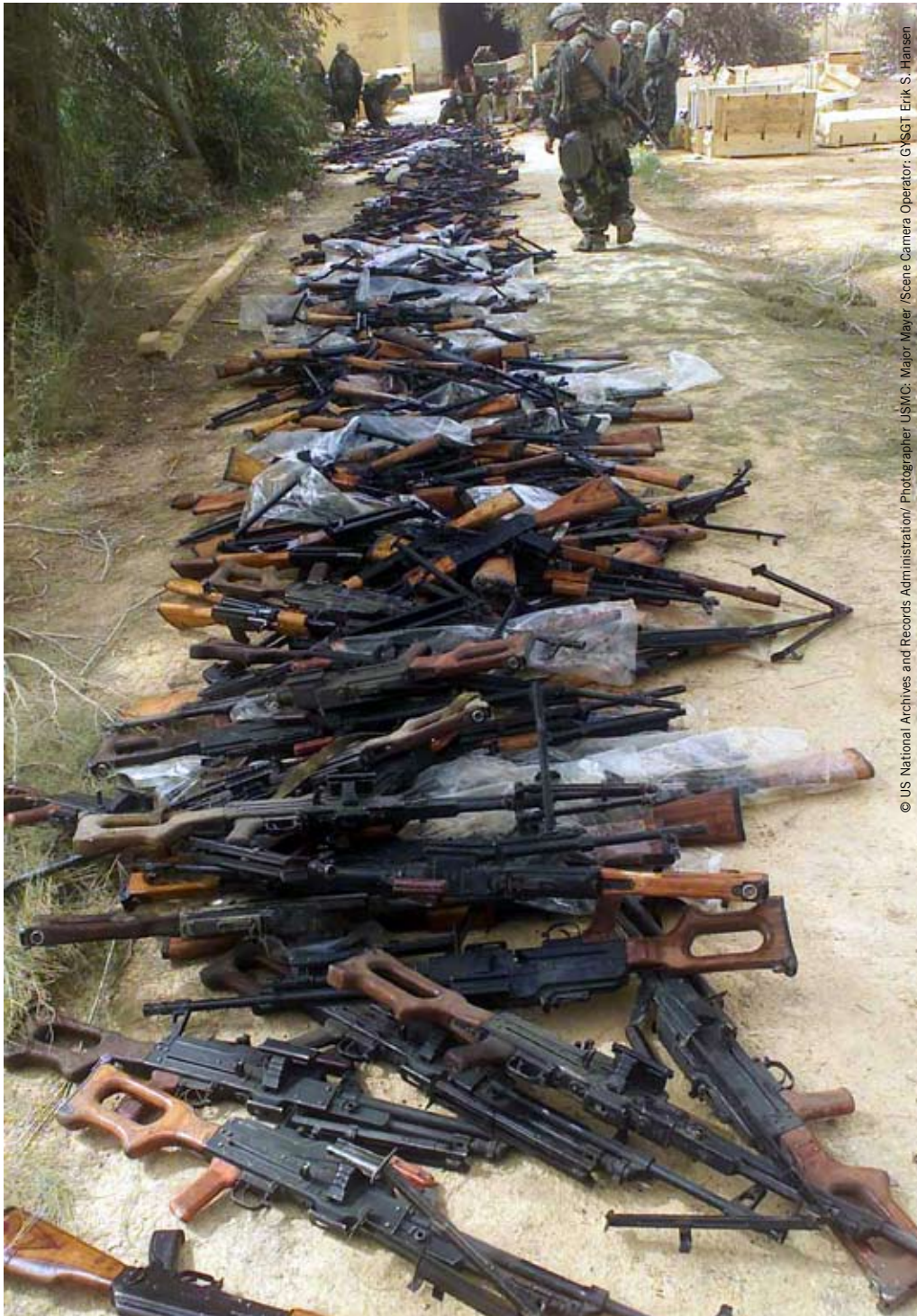
Captured weapons cache containing hundreds of Russian Dragunov automatic rifles, outside of Jaman Al Juburi, April 2003.

More than one third of soldiers and marines reported that torture should be permitted to save the life of a fellow soldier or marine, and less than half said they would report a team member for unethical behaviour. 105 These findings were largely replicated in another survey in September and October 2007. 106