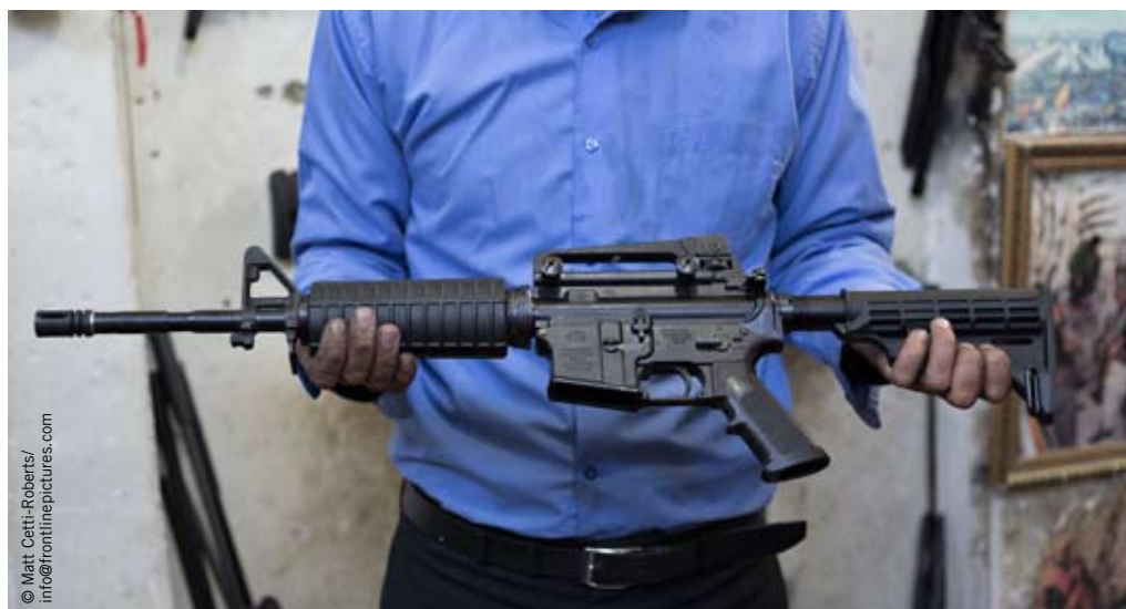
A Kurdish gunsmith holds a US-made M16A4, previously in the possession of the Iraqi army, and later IS, after the weapon was converted in to an M4 carbine-type rifle. Erbil, September 2014.

The main rifle type used by IS is the AK (Avtomat Kalashnikov) family of automatic rifles, as well as close copies and derivatives, with a bias towards the Russian and Chinese types that have been the staple of the Iraqi army for decades. Most of these weapons are decades old, though the more modern Russian AK-74M is in evidence, most probably looted from Syrian army stocks. IS forces have also captured US-manufactured small arms, including M16 assault rifles, along with Chinese, Croatian, Belgian and Austrian small arms. 9