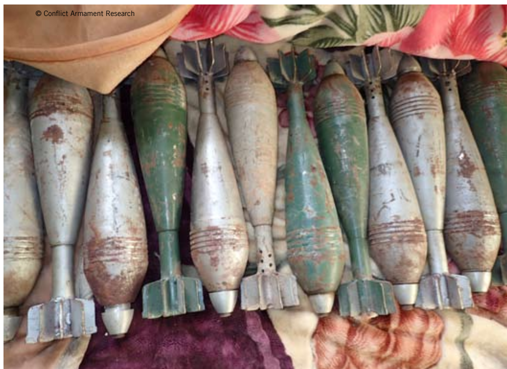
Improvised mortar rounds manufactured by IS forces and captured by Syrian Kurdish People's Protection Units documented by a Conflict Armament Research Field Investigation team on 21 February 2015 in Kobane.

IS captured an unknown quantity of 155mm M198 towed howitzers from Iraqi military stocks during its capture of Mosul in June 2014, along with the older Chinese Type 59-1, which the Iraqi army used extensively during the 1980-1988 Iran-Iraq war. 23 IS has also captured former Soviet Union D-30 and M-30 122mm howitzers from Syrian military stocks and small numbers of the older, and now obsolete, M-30 models which were probably taken from the Syrian army's reserve storage for deployment.