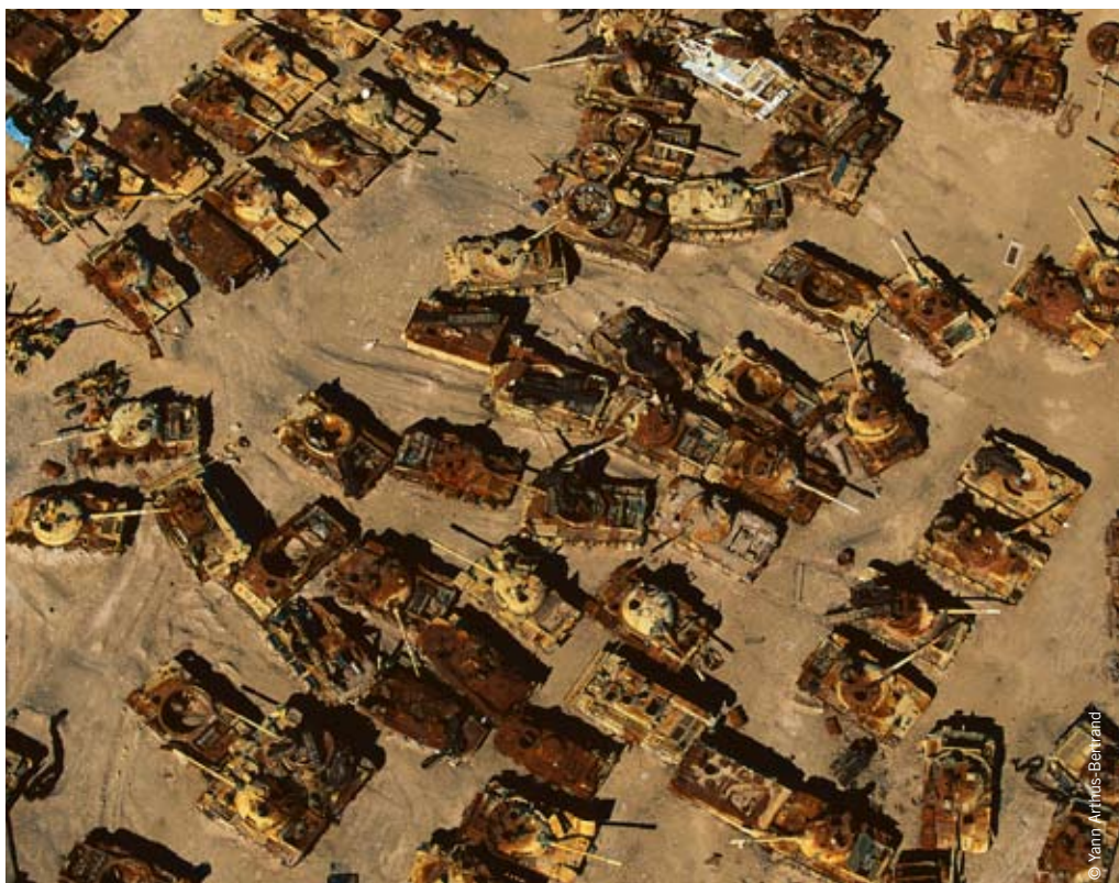
Iraqi tank junkyard in the desert near Al-Jahrah, Kuwait, January 1991.

President Hussein built up an indigenous arms industry, producing small arms and ammunition, modelled on the Russian AK series, Russian T-72 tanks under licence, howitzers, anti-tank grenade launchers (RPG-7) and Beretta-type pistols. According to Jane's Sentinel Security Assessment, by 1990 the country "was largely self sufficient in the production of small arms ammunition, rocket propelled grenades (RPG) [sic], mortar and artillery shells and aircraft bombs". 85