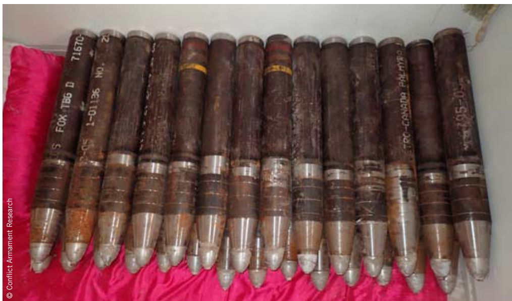
Improvised ground-to-ground rockets manufactured by IS forces and captured by Syrian Kurdish People's Protection Units in Kobane, documented by a Conflict Armament Research Field Investigation team on 21 February 2015 in Kobane.