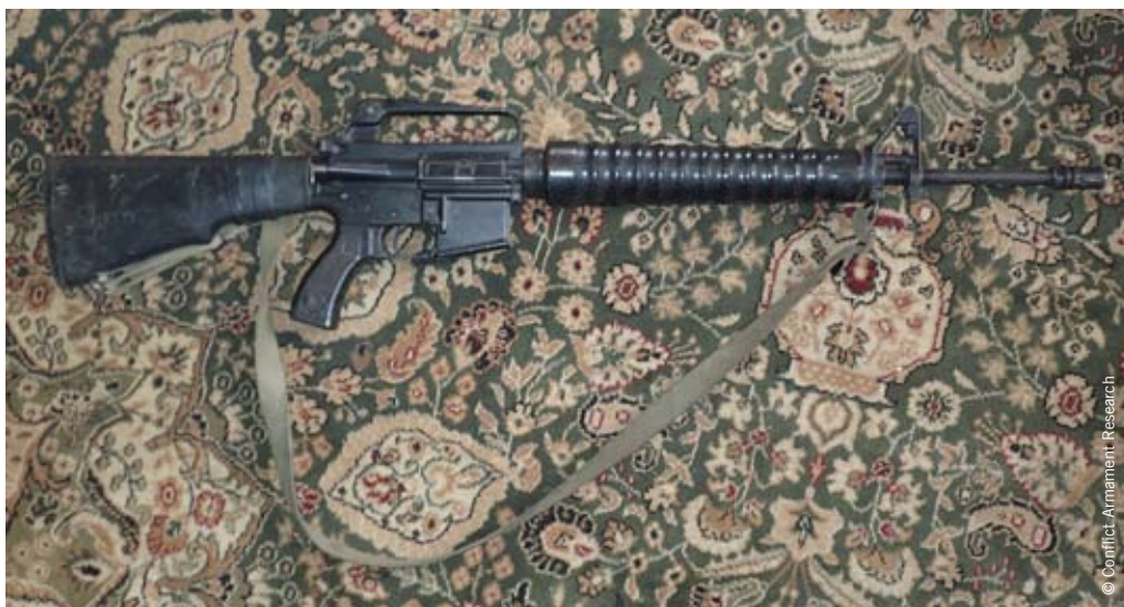
Chinese CQ 5.56mm rifle captured from IS forces by Syrian Kurdish People’s Protection Units during the siege of Kobane and documented by a Conflict Armament Research field investigation team on 24 February 2015 in Kobane.

In February 2015, Conflict Armament Research documented two Chinese CQ 5.56mm rifles which had been captured from IS fighters by Kurdish People’s Protection Units fighters. The rifles had had their serial numbers ground off and painted over with black paint; they were loaded with Chinese ammunition manufactured in 2008. Exactly the same configuration – from the removed serial numbers to the black paint and 2008 Chinese ammunition – had previously been observed by Conflict Armament Research and Small Arms Survey researchers in relation to Chinese CQ rifles identified in South Sudan among rebel forces in 2013. 66