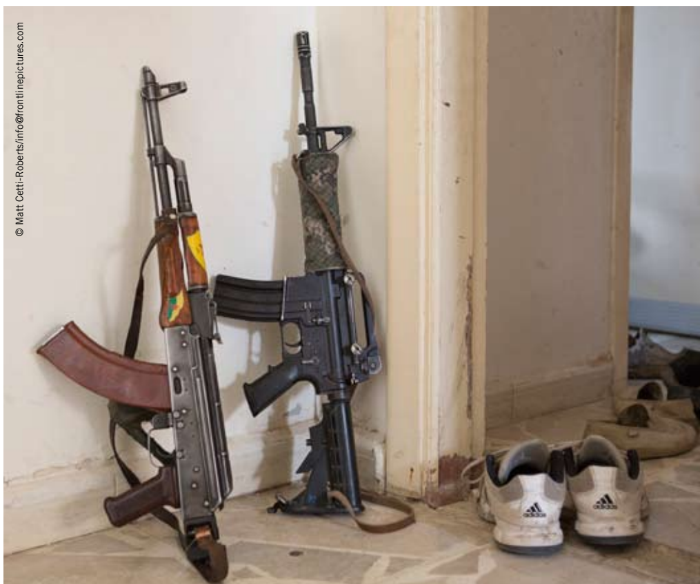
A Chinese-made Kalashnikov and an American M4 rifle (the latter captured from IS fighters) lean against a wall in a building occupied by Syrian Kurdish People's Protection Units fighters in Al-Yarubiyah, Syria, September 2014.