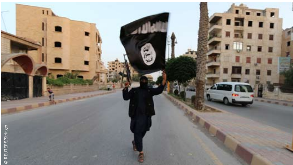
IS fighter waves the IS flag in al-Raqqah, Syria, June 2014.

After a brief summary of IS' formation and subsequent expansion, this chapter describes the arsenal of the armed group which has allowed it to maintain its control over parts of Iraq and Syria and commit crimes under international law.