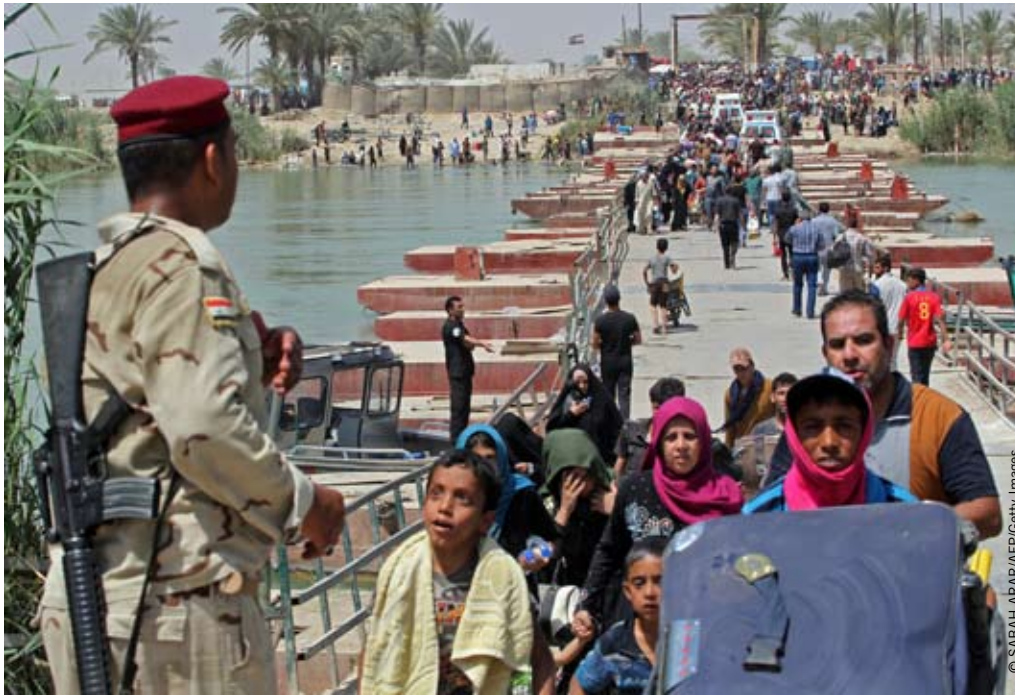
Residents from Ramadi, displaced by IS' capture of the city, wait to cross Bzeibez bridge on the southwestern frontier of Baghdad, May 2015.

entered Iraq with private security companies during the US occupation and found their way into Iraqi arms markets. 49