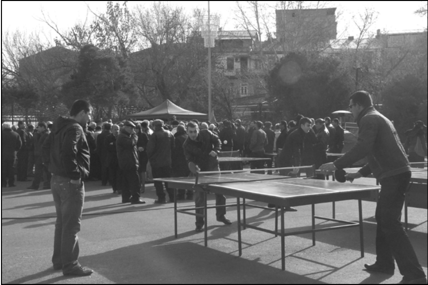
Fig. 12: Hunger strike in the Theatre Square, 2011.

phical spots in Armenia (fig. 7), but this time these were the representatives of the parties that comprised the opposition (Armenian National Congress). The unity of the people in the square was constructed and not spontaneous.