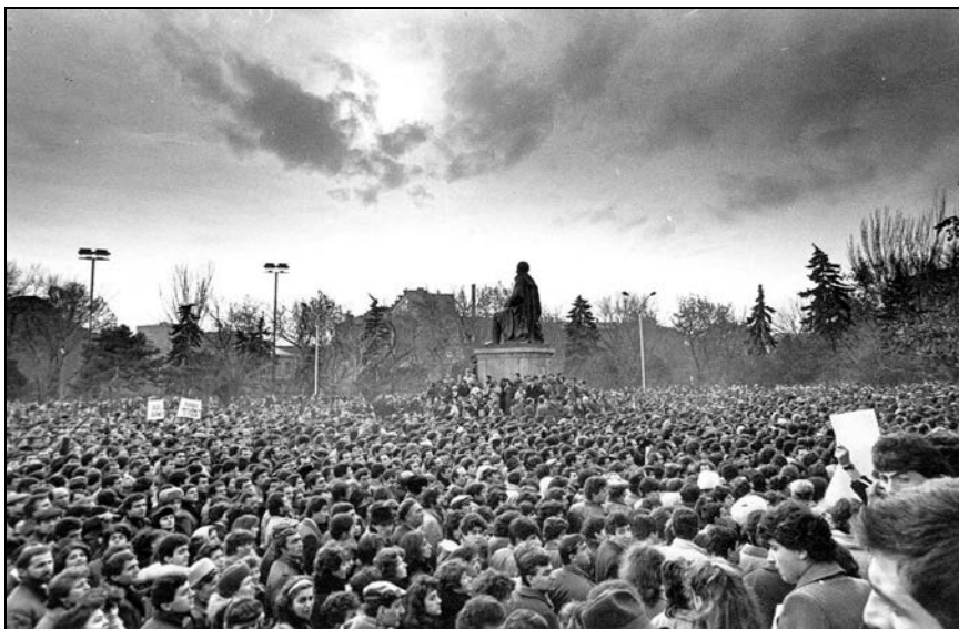
Fig. 1: Theatre Square, 1988.

Committee of the Communist Party of Armenia demanding the calling of an extraordinary session of the Supreme Soviet (in order to consider the petition of the Karabakhians), a large number of workers had already joined the procession. From the 25 to 27 February, people from the countryside arrived in the city and joined the demonstrations, giving it a universal character and leading to an unprecedented outburst of national self-consciousness (fig. 1). What is important here is that a special situation was created in which the people were joined in a kind of united body, much like that of the medieval European carnival keenly characterised by Mikhail Bakhtin (1968). This immense body, which probably amounted to a million people at the peak of the demonstrations (and this is in a city with a population of a million), was not created mechanically. It had a united spirit, a common ideal and, finally, a common sense of national self-consciousness. According to the statements of many participants, they had a wonderful feeling of being present everywhere, in every place occupied by that huge body of people.