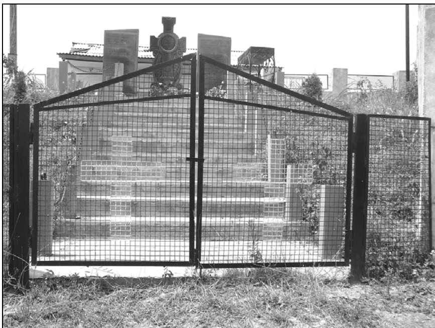
Fig. 1: Nor-Aygestan.

The new generation born in Nor-Aygestan is actually binding their parents to this land. This process of adaptation is well illustrated in the history of the cemetery of Nor-Aygestan. There was no cemetery in the village when the first settlers came. The first person to die was buried outside the village, although in a lower place than the village itself. »This is not the right place for the cemetery. Cemeteries are usually set on hills« said the head of the village. The cemetery was established much later, in 2008, when the monument was built. This is not a coincidence. These two events are vivid markers of the process of community-building and the establishment of social structures that reveal the acceptance of this new space as »home«. The erection of the monument was sponsored by one of the villagers from old Chaylu/Aygestan who was now living in Yerevan, which is also in itself remarkable. He invested money into the social and cultural domestication of a space in which he has never lived, but clearly cared about, as if recognising it as his own new home village.