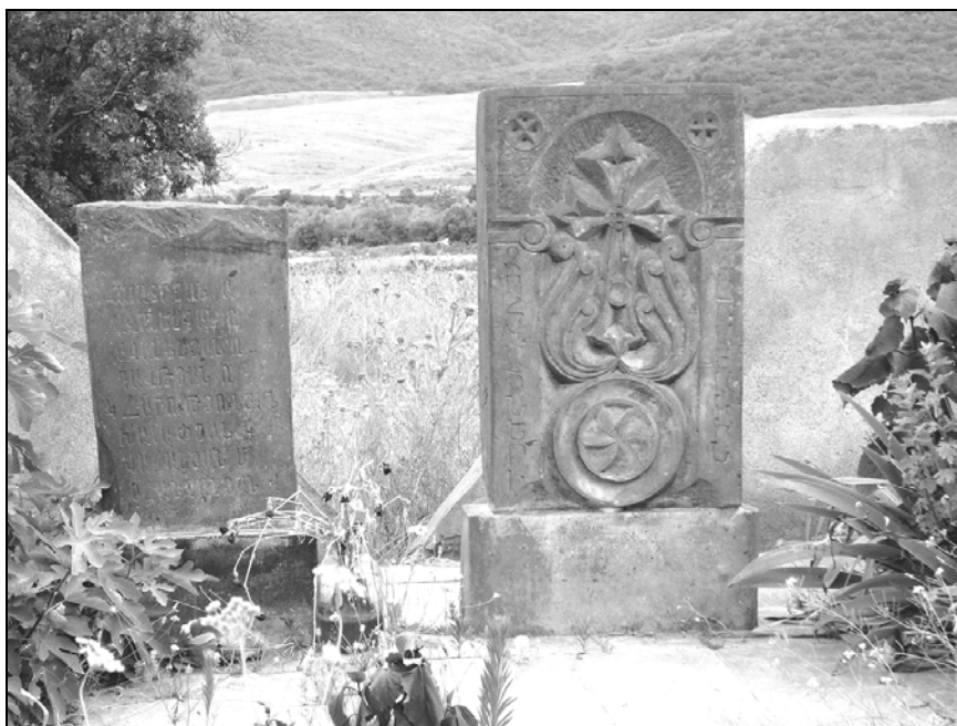
Fig. 2: Nor-Seysulan.

population of the region began, the inhabitants of old Seysulan were offered to choose a place for their new village and they agreed on this one. They liked the landscape, they said. Until recently, the people were able to visit the cemetery in old Seysulan, but the situation worsened, skirmishes became more frequent and this became too dangerous. Nor-Seysulan is the only newly-established village in the region that celebrates the day of the reconquering the original village as a holiday despite the fact that they do not have access to it. This creates a very ambiguous situation of simultaneous senses of loss and hope of a final return to the homeland. The latter is gradually fading, not only because of the current impossibility of return but also due to processes of social, economic and cultural adaptation to the new space. But this ambiguity nevertheless entails a doubling of monuments and a differentiation of functions described for the previous case of Nor-Aygistan.