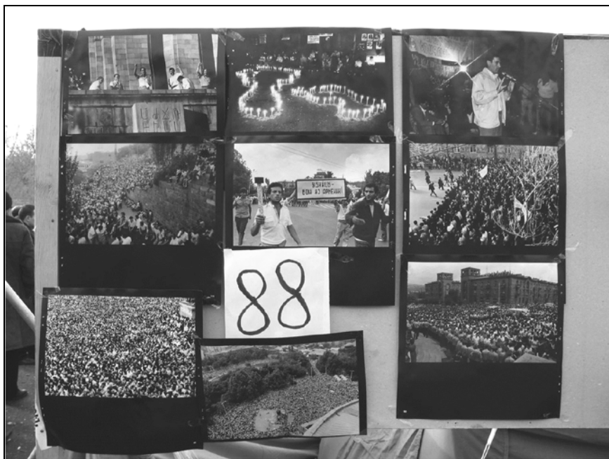
Fig. 9: A 1988 picture-citation on a tent, Freedom Square, 2008.

versal ritual (festive) characteristics? Understanding that the discussion of these questions requires another format and much more space, we will focus briefly on some initial points that have drawn our attention when comparing more recent rallies with the ›festival‹ precedent of 1988.