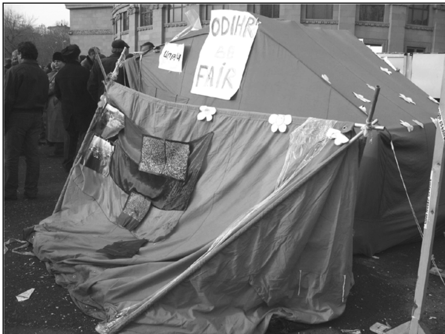
Fig. 8: Tent with 1988 picture-citations, Freedom Square, 2008 (photo by Gayane Shagoyan).

mentioned the first President's call to use him as an instrument for realising social change (he said this during the first electoral meeting in 2007). On the other hand, his activities and he himself were interpreted as an instrument used by foreign anti-Armenian forces.