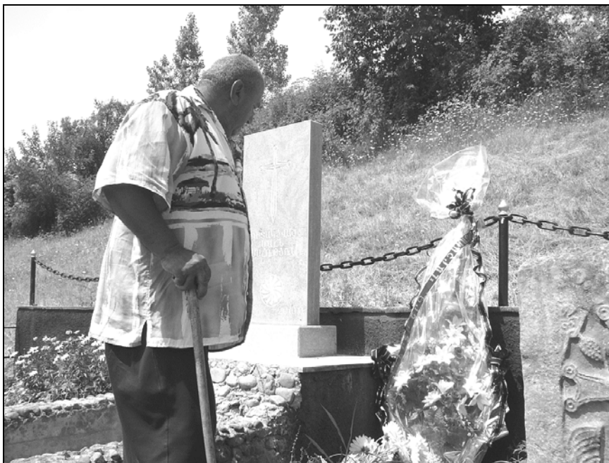
Fig. 3: Hovtashen, with a villager visiting the monument

unofficial competition between the heads of the villages. In these terms, the monuments might be viewed as symbol and tool of power. The monument in Nor-Seysulan looks less representative than its counterparts in the neighbouring villages of Nor-Aygestan and Hovtashen, and is perceived as a challenge to Nor-Seysulan's village head. But the planned renovation of the monument might also be considered a first sign of the complete adaptation of the villagers to their new home; that they have given up on returning to their old village.