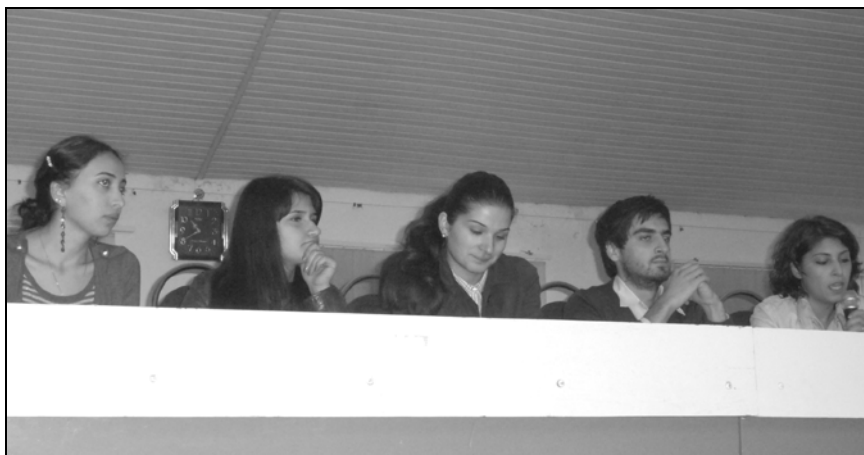
Fig. 1: Student's presentation during »Caucasus, Conflict, Culture 1« in Tbilisi, November 2011.

argued that the younger generation is still not free of prejudices. Students and scholars agreed on the point that individual exchange between two conflicting parties is necessary to reduce prejudices.