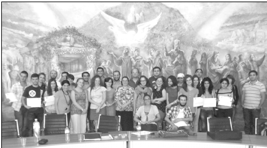
Fig. 3: Participants of ›Caucasus, Conflict, Culture 3‹ in Tbilisi, August 2013; some participants are not on the picture.

lived there. The second aim of CCC3, and the central aim to all ›Caucasus, Conflict, Culture‹ projects was to create a forum in which student and graduate anthropologists (and scholars in related disciplines) could work and discuss together intensively.