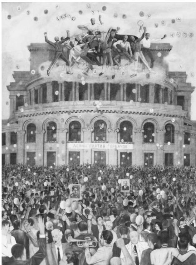
Fig. 2: Theatre Square, 1988 (painting by Hakob Hakobian, 2000, reproduced by kind permission of the artist).

tion. Thus the word ›democratisation‹, a twin concept to Gorbachev's glasnost, implies a process, a movement of essential mass character. ›Democratisation‹ is often opposed to the concept of democracy (in the way that glasnost is opposed to the liberty of the word/speech), but for our festive approach this is just the word (concept) with an ›archaic‹ touch that inspired the spirit of the proto-festival in the event.