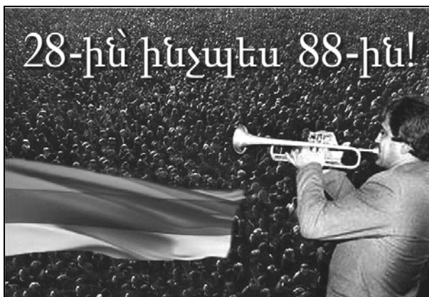
Fig. 13: an Internet poster calling to a meeting on October 28, 2011. The inscription reads: »On October 28 as in 1988!« (web address unknown).

to mention the developments, concrete products or by-products that could have been expected as a result of such solidarity), its historical experience had to be instrumentalized by the organisers of new rallies.