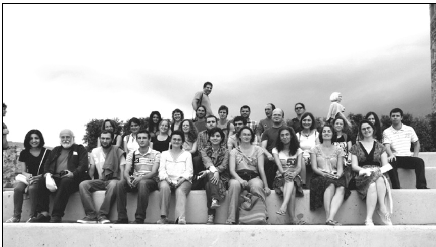
Fig. 2: Participants of »Caucasus, Conflict, Culture 2« in Akhaltsikhe, August 2012.

local colleagues in anthropology. This collaboration did not take place »on paper« alone, but in day-to-day research, together with our students in intense relationships. It was important to get involved with the position of the other, even if we were often not of the same opinion. This was not always easy; different academic traditions collided, and different ideas on theory and methodology.