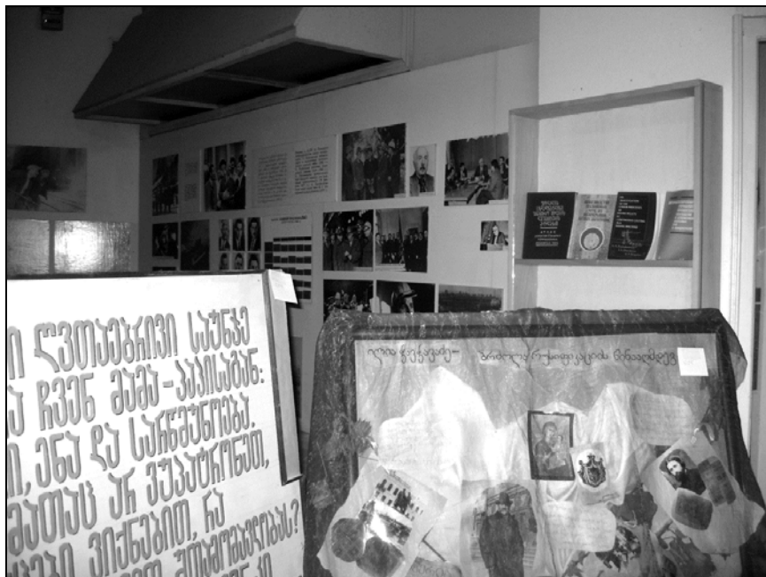
Fig. 3: Permanent exposition in the Rustavi City Museum showing the construction of the Rustavi Metallurgical factory: it is mostly covered by a poster made by students for the school history contest. The posters represent the life of Ilia Chavchavadze (1837-1907), considered as father of the Georgian nation.