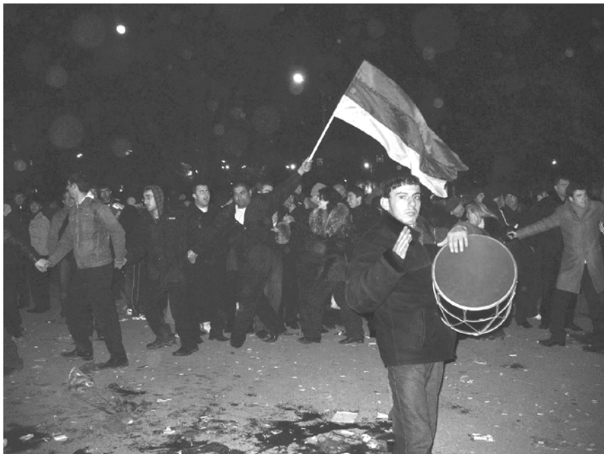
Fig. 4: Night dancing at the Freedom (Theatre) Square, 2008.

in fact, provides society with a mechanism for withstanding transformations of any kind. In the second, by contrast, it provokes society to change its structure. Therefore, by observing how a society emerges out of the chaotic festival-state, one can establish the type it is drawn toward and, in turn, anticipate its future development. In our case, most binary oppositions were restored in one way or another (Abrahamian 2006: 235-243).