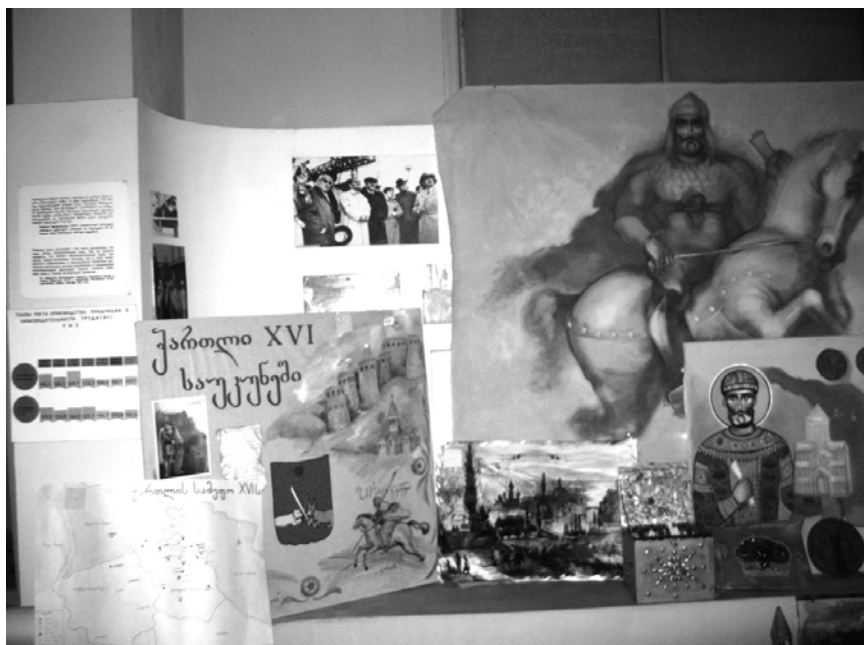
Fig. 2: Permanent exposition in the Rustavi City Museum showing visitors and guests of the Rustavi Metallurgical factory: it is mostly covered by a poster made by students for the school history contest displaying motives from the 16th century and of King David the Builder (1073-1125), which is considered to have been the most powerful ruler of Georgia.