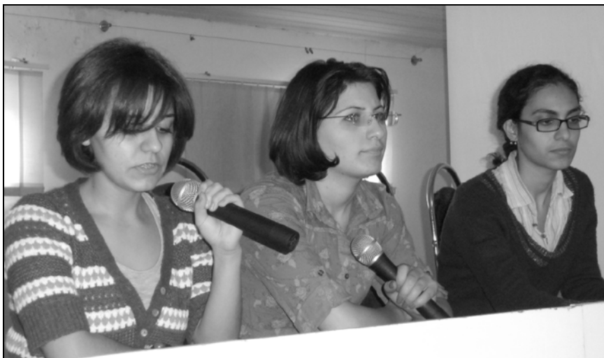
Fig. 2: Student's presentation during ›Caucasus, Conflict, Culture 1‹ in Tbilisi, November 2011.

The Georgian students emphasised the importance of face-to-face discussions on the issue of conflict for Azerbaijani and Armenian students and expressed their hope that in the future it will be possible to invite Abkhazian and Ossetian participants as well. In groups where the task was to talk about the Nagorno-Karabakh conflict, it was easier for Georgian and German students to remain neutral. The Abkhazian and South Ossetian conflicts were discussed with only one (the Georgian) side present, which created some discomfort. However, it was impossible to involve young Abkhazian and Ossetian people in the project.