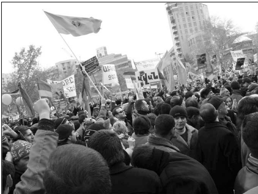
Fig. 3: Freedom (Theatre) Square, 2008 (photo by Gayane Shagoyan).

the ball of yarn. However, it was carnival civil society, and, like everything produced in a festival, it was also doomed to vanish. A real civil society must be constructed in a Parliament brick upon brick, as a result of everyday, routine work, and not in the square, as the euphoric result of a festival's short-lived feeling of justice and solidarity.