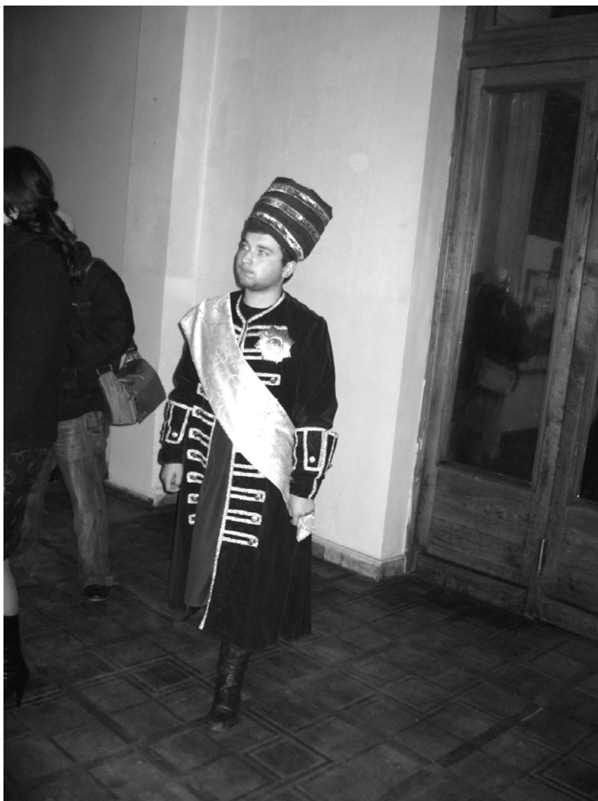
Fig. 4: This photo was taken on the award ceremony of the school history contest (11 December 2011). The boy is wearing the costume of Erekle II (1744-1798), the last king of Kartli-Kakheti.