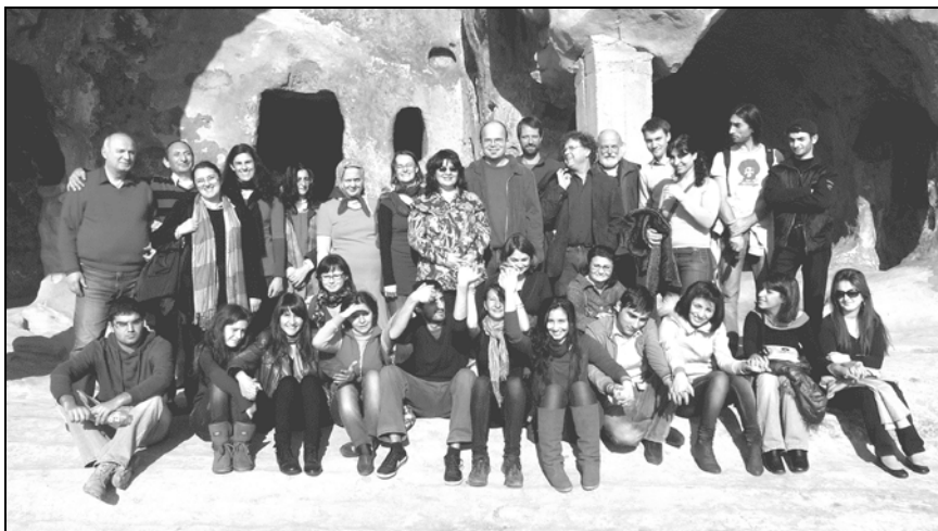
Fig. 1: Participants of »Caucasus, Conflict, Culture 1« in Uplistsikhe, November 2011; some participants are not on the picture.

suspect no interrelations at all. The second heading might be called the role of ethnicity and the third the (re)construction of history. These three core issues are reflected in the contributions to this volume.