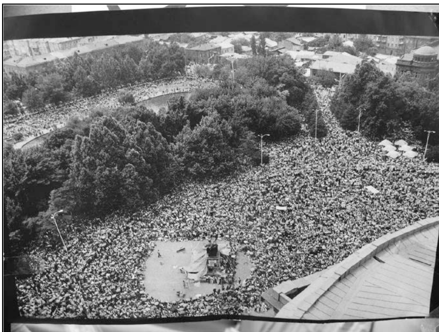
Fig. 10: Picture-citation of a 1988 hunger strike, Freedom Square, 2008.

can see some obvious characteristics of a group fighting for civil society, 12 this time for a real, and not carnivalesque or illusionary one as was founded in the same square twenty years ago.