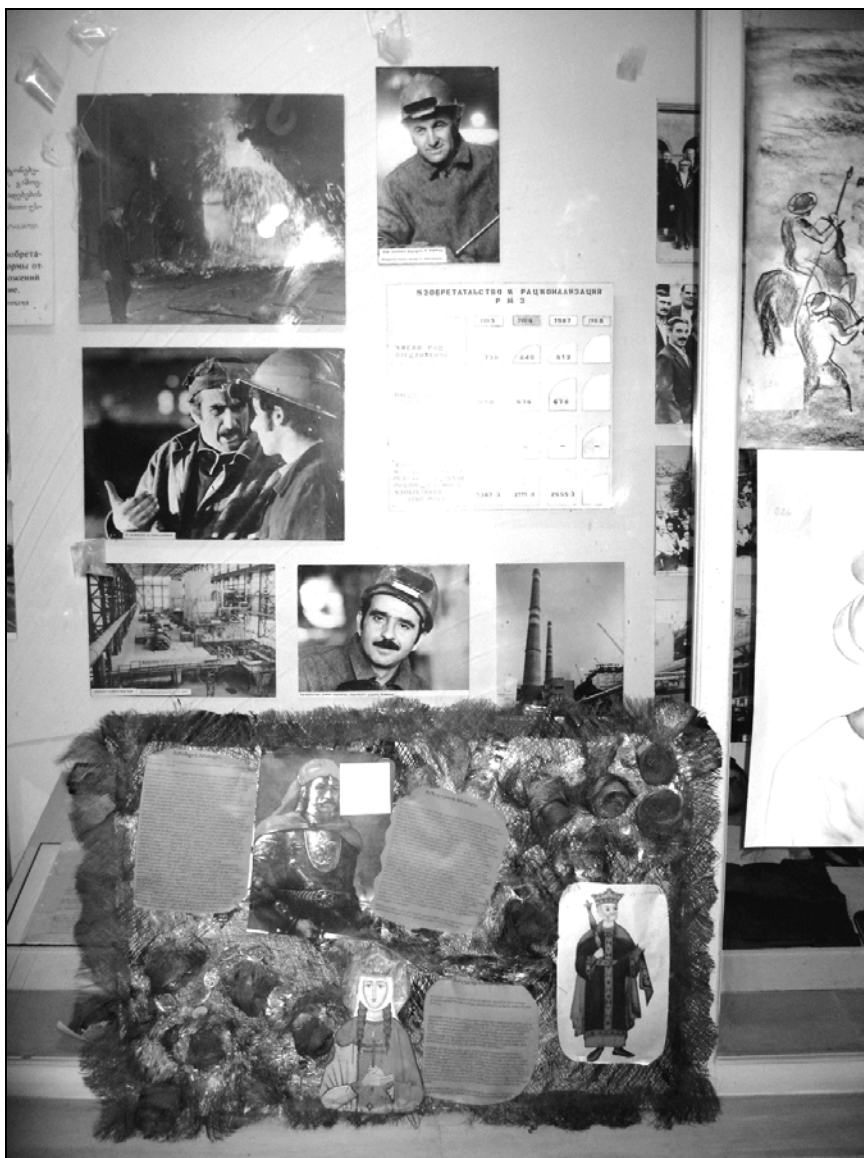
Fig. 1: Permanent exposition in the Rustavi City Museum showing ›heroes of labour‹ of the Rustavi Metallurgical factory: it is partly covered by a poster made by students for the school history contest. The poster represents three battles from the 17th century. On the poster is a picture of St Ketevan the Martyr, who was killed after tortures for refusing to give up Christian faith.