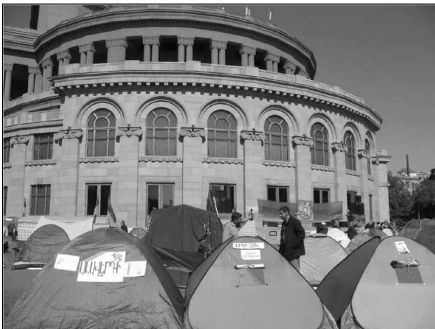
Fig. 7: ›Warning‹ protest action at Freedom Square, 2011.

The February 2008 post-electoral rallies resembled the 1988 insofar as they both lasted days and nights. During the 2008 rallies, some festival elements were actively used by both organisers and participants, including dancing. One might have thought that the festival model of the political rally was being reactivated. However, the festival atmosphere during the 2008 rallies felt more like a constructed (albeit essential) element, and not its basic structure. Participants in 2008 did not comprise a unified group – a principal characteristic of the 1988 ›festival‹ (Abrahamian 1990a: 76). Many joined the former President only to use him, following his own proposal ›to use him as an instrument‹. As for the dancing, participants and organisers often danced just to get warm in the frigid February air and not because of any inherent ›festival‹ structure. The dancing itself called forth a festive mood (fig. 4) – quite in accordance with the Durkheimian statement that people do not cry because they feel fear, they feel fear because they cry.