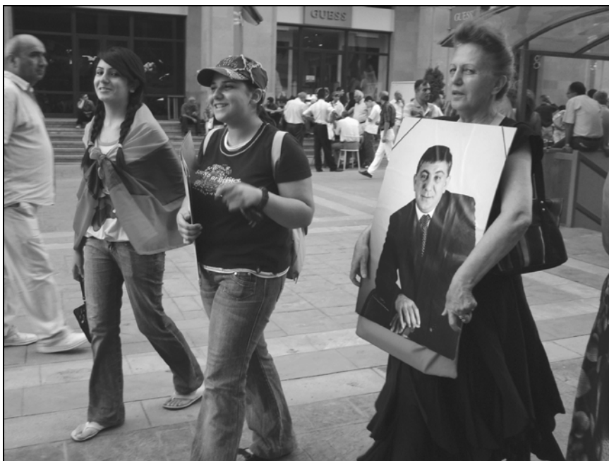
Fig. 5: A «political promenade» on Northern Avenue, 2008.

To conclude, the metaphoric ball of yarn that manifested the synergetic restructuring in the square in 1988, which we compared typologically with an archaic festival, left a nostalgic impression among the participants that they had experienced a national consolidation and a «weak civil society in the square. On the other hand, as a result of this «festival» a real change of power took place, whether the result of purposeful fight or a thread pulled from the ball of yarn. No wonder that twenty years later, in the next attempt at revolution, it was the model of the festival that was taken as an instrument to realise such change.