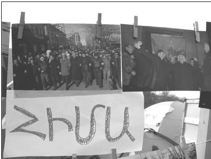
Fig. 6: HIMA! tent with a picture showing activists dancing (an ›invitation‹ to dance), Freedom Square, 2008.

Ter-Petrosyan, the first President of Armenia who resigned from his position in 1998, declared his renewed candidacy for President. He managed to amass quite significant support during rallies on the Theatre Square, now renamed Freedom Square (fig. 3), there where he and his fellow members of the Karabakh Committee had rallied in 1988.